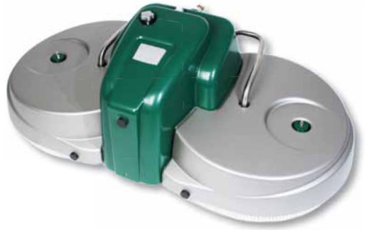
PvSpin – The practical and easy-to-handle module cleaning device

Module cleaning devices have long consisted of telescopic rods with cleaning brushes affixed to the top. The PvSpin is the first of its kind; a consistently effective, easy-to-handle module cleaning system powered by water pressure.